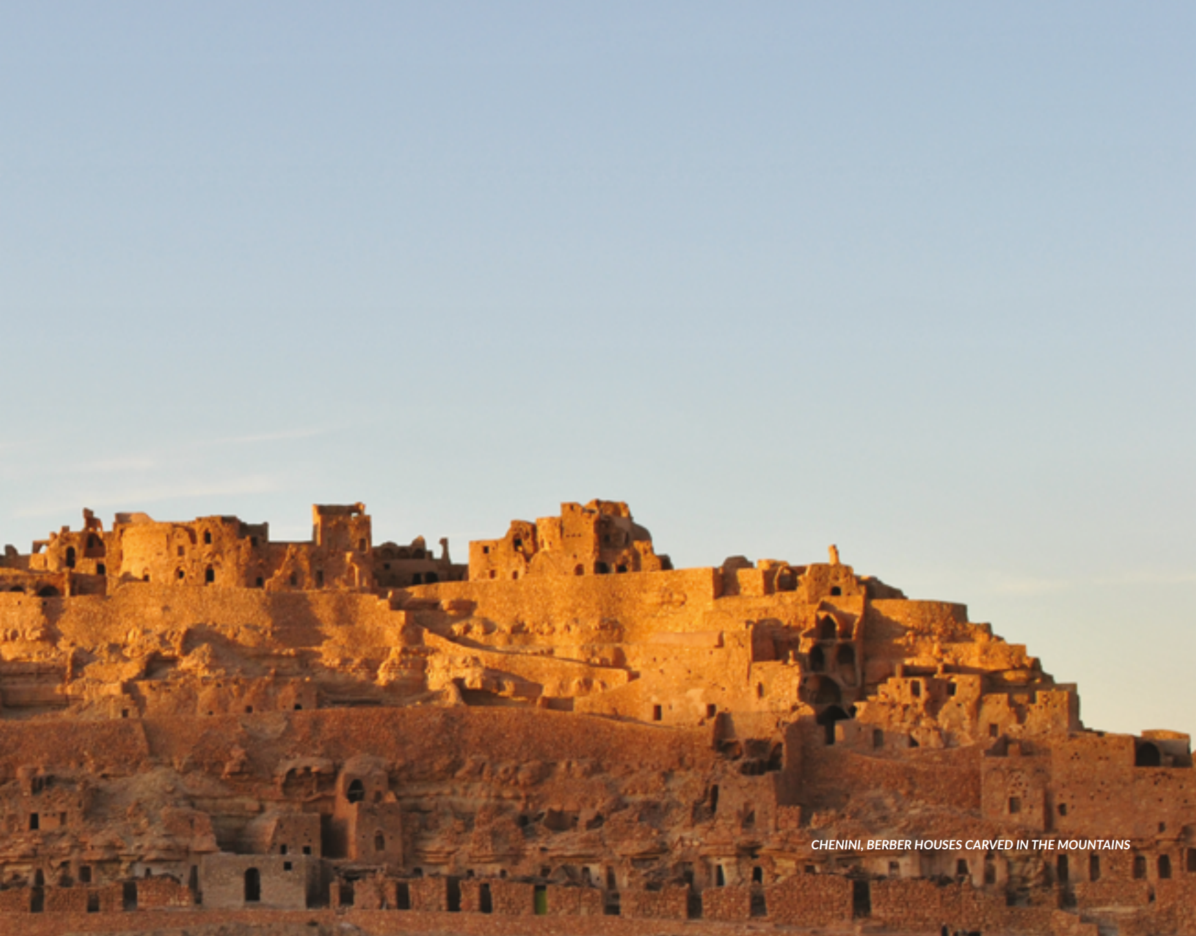
CHENINI, BERBER HOUSES CARVED IN THE MOUNTAINS